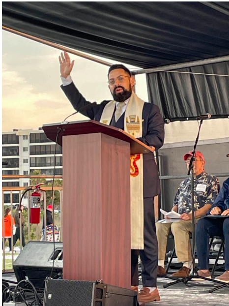
Easter morning in the Sanctuary.